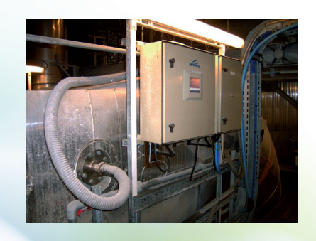
On-stack or close-coupled installation